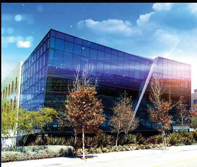
■ ICANN headquarters, Los Angeles, California.

Under the stewardship of ICANN, the number of top-level domains has exploded in the past ten to twenty years. Today, the root name servers serve 1,509 top-level domains - each with their own sub-assigned registrars, registration mechanisms, name servers, whois servers, and support infrastructure. And that is just for the top-level domains, below them are tens of thousands more secondary level domains.