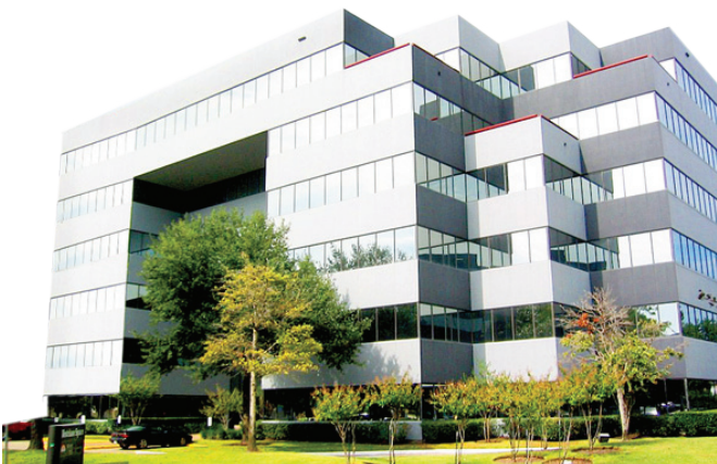
■ Network Box USA, Houston, Texas.